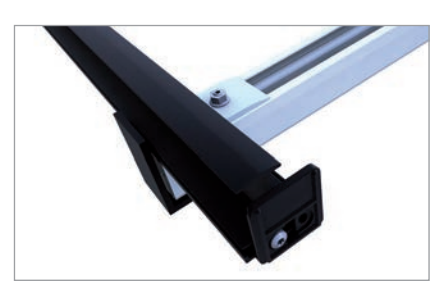
Closing insertion rail and C-rail