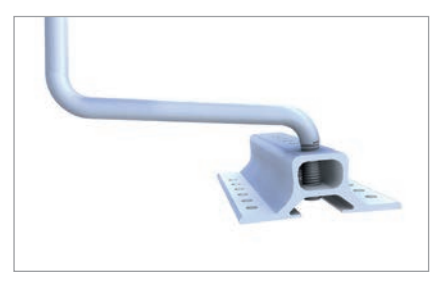
Height-adjustable flex roof hook set