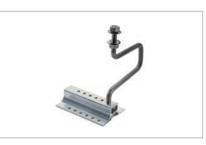
Light roof hooks for narrow rafters