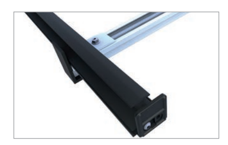
Closing insertion rail and C-rail