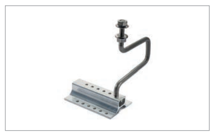
Light roof hooks for narrow rafters