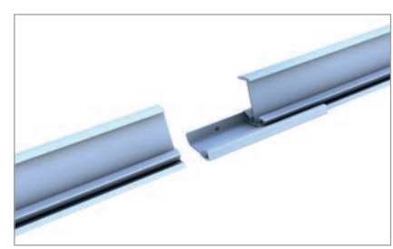
Rail connector insertion rail