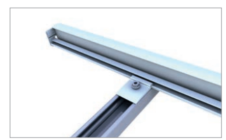
Insertion rail on C-N-rail