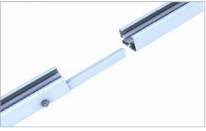
Connector C-N-rail 37