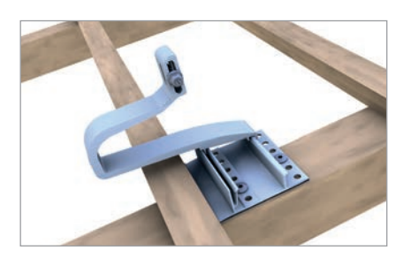
Position of base profile on rafters