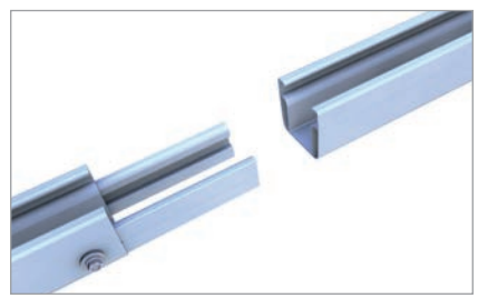
C47 S rail connectors for profile clambers