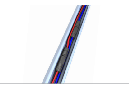
C-N-rail as cable channel