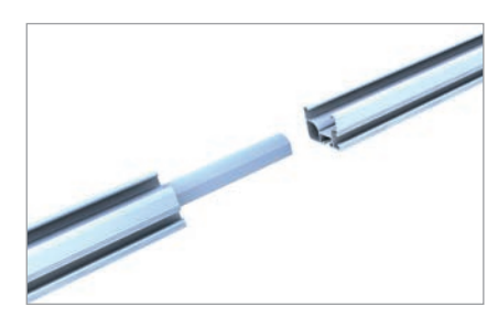
Connector C-N-rail 37