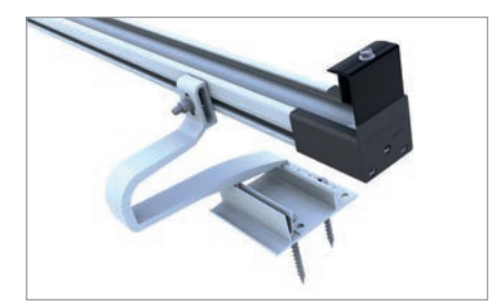
End clamp and end cap in C-N-rail