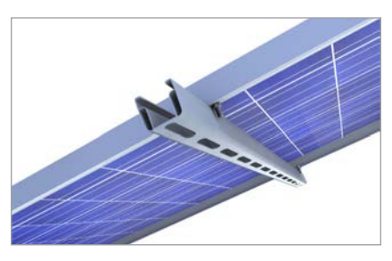
Slip guard for fixing modules