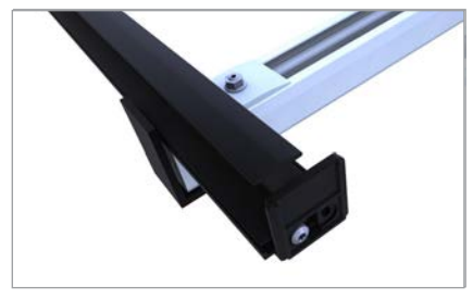
C-rail connector extern