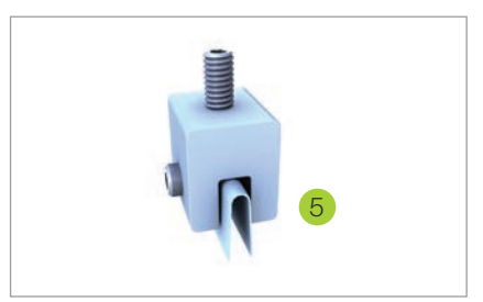
Clamp with VA saddle for copper standing seam