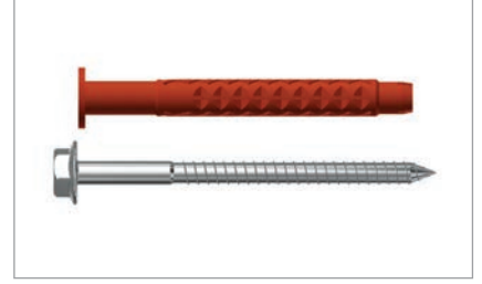
Dowels with technical approval