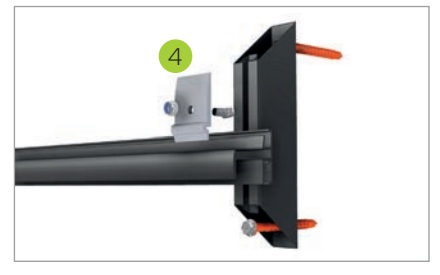
Few components - simple and fast installation