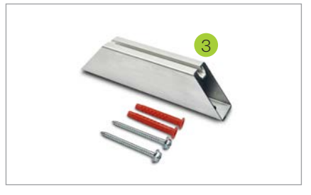
Socket set, optional in blank and black