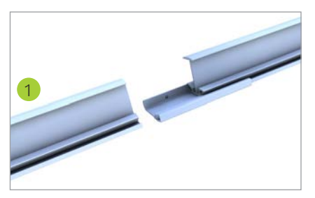
Connecting insertion rails